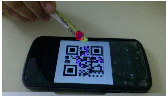
Fig. 2.3.1: Marker tracking overlay

<Step by step description of the image can be added>