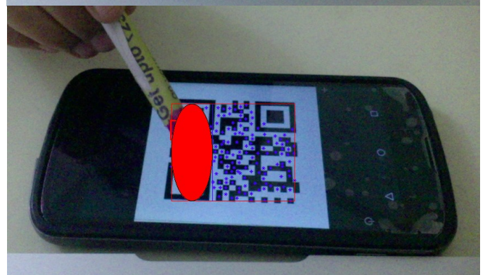
Fig. 2.3.2: Predefined separate areas detected on taps