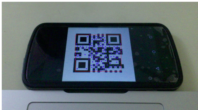
Fig. 2.2.1: SIFT detection

Homography (calibration) is a fundamental one-time process carried out in our project. In this step we calibrate the position of the virtual musical instrument i.e. paper which is in front of our camera. For calibration we use an image transform function imported from an external package called vlfeat. The function SIFT(Scale Invariant Feature transform) <add more vlfeat and sift data here> extracts descriptor matrices for a certain number of pixels in the image. The SIFT is applied to both an input frame from the video source and the template image stored in the computer's memory. These matrices are matched with each other to give a set of pixels on the source image which are completely matched with the corresponding pixels in the template image. This can be observed in a graph plotted in which matches two such images and returns the following result.