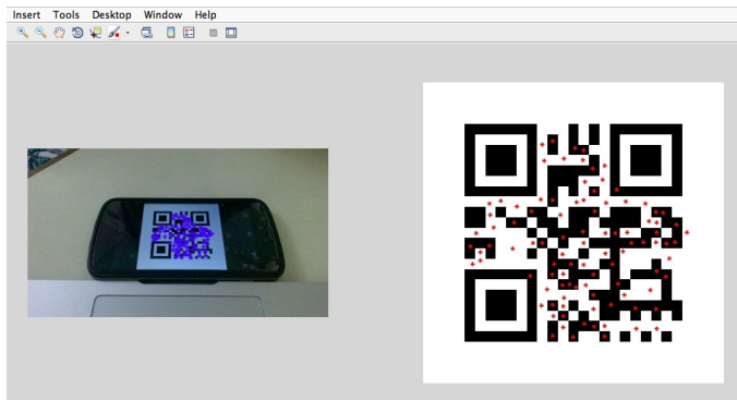
Fig. 2.2.1: Corresponding template features